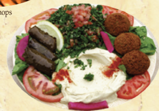
Ultimate Vegetarian Combo