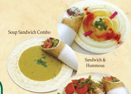
Soup Sandwich Combo