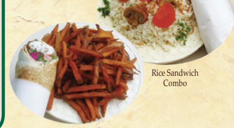
Rice Sandwich Combo